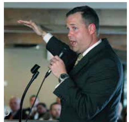
U.S. Rep. Jim Bridenstine