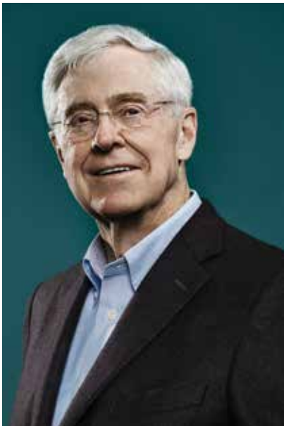
Right-wing advocacy groups associated with billionaires David (top) and Charles Koch are fueling grassroots opposition to the Common Core.