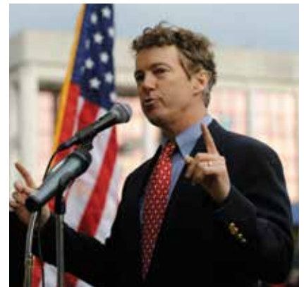
U.S. Sen. Rand Paul

Advocacy groups associated with the billionaire industrialist Koch brothers, some of them playing key roles in organizing grassroots opposition, envision the Common Core fight as just the prelude to larger changes: enacting school privatization measures across the country.