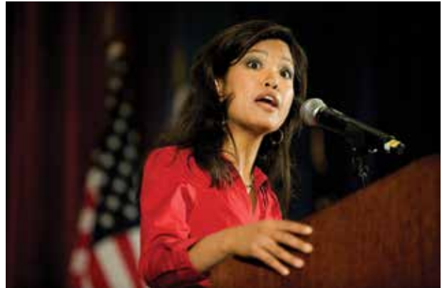
Glenn Beck, who sponsored two anti-Common Core strategizing conferences in 2013, calls the Common Core “evil.” Commentator Michelle Malkin claims “government meddlers” will gather “intimate data” on children and sell it to business interests.