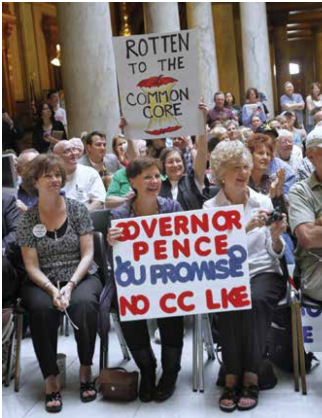
Hoosiers Against the Common Core stages a rally at the Indiana Statehouse in April. Indiana became the first state to drop the standards after Gov. Mike Pence signed legislation ordering the state school board to draft new ones.

promiscuity, pornography, violence, and “other corruptions.” One of its projects, American Principles in Action, has led campaigns against teaching about LGBT people in schools and has worked against the repeal of the military’s anti-gay “Don’t Ask, Don’t Tell” policy.